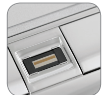
▶ Fingerprint Reader