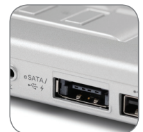
▶ USB Sleep-and-Charge/eSATA port