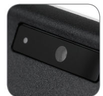
▶ 0.3 Megapixel web camera